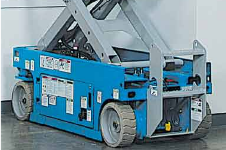
NON-MARKING TYRES These hard rubber non-marking tyres prevent scuffing floors or picking up debris that could otherwise damage a floor.