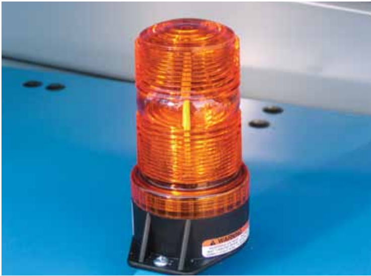
DUAL FLASHING BEACONS Orange flashing lights warn workers when lift is moving or in operation.