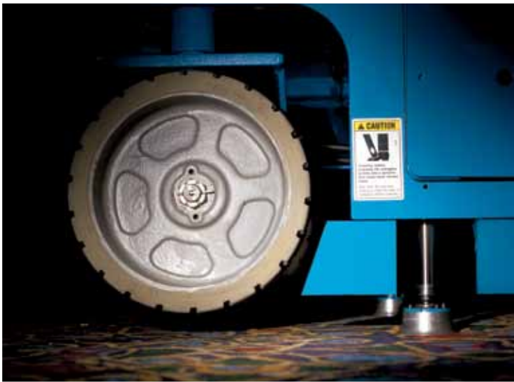
SELF-LEVELING OUTRIGGERS The Genie® GS™-3232 slab scissors model helps maximise uptime with a compact, manoeuvreable design and automatic hydraulic, non-marking, self-leveling outriggers that level the lift on uneven ground – up to 5° side to side – before elevating the platform.